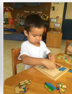
Math & Logic